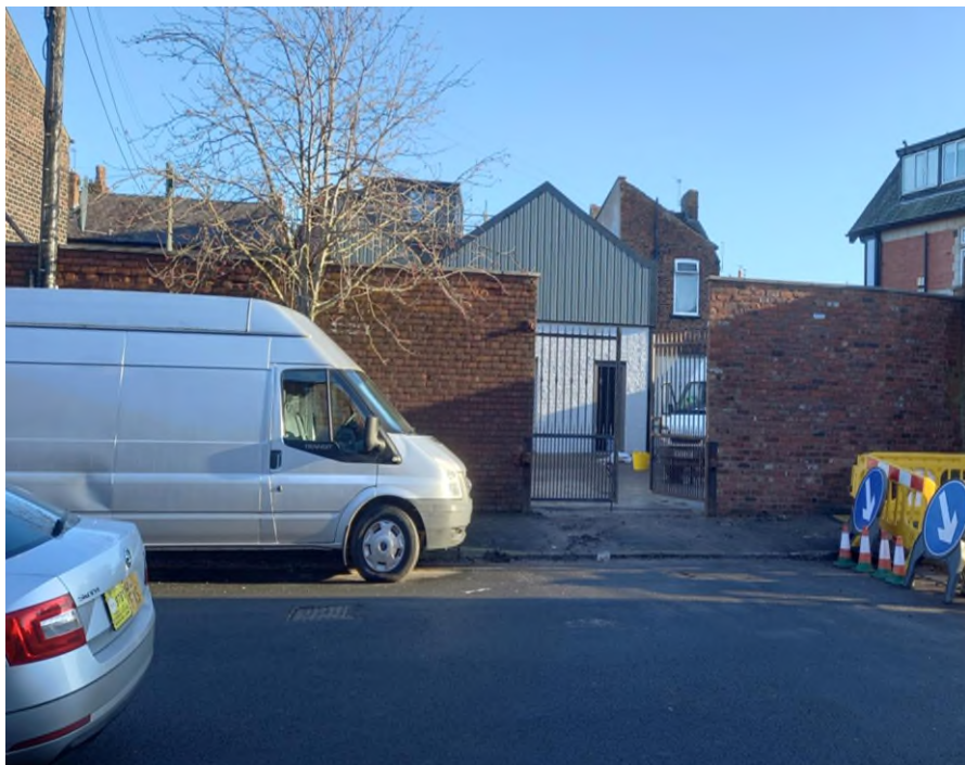
Existing site – rear view