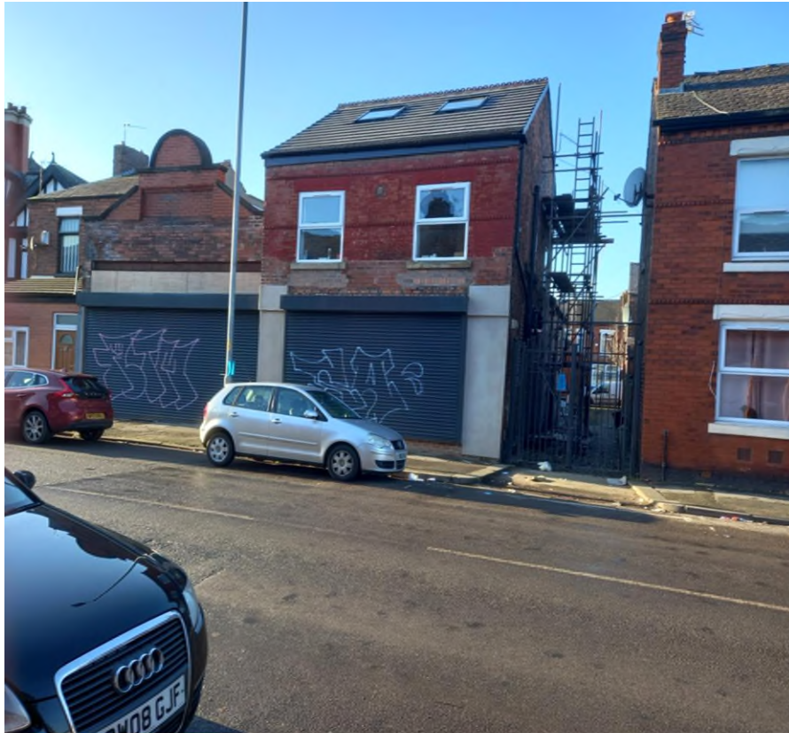
Existing site – front view